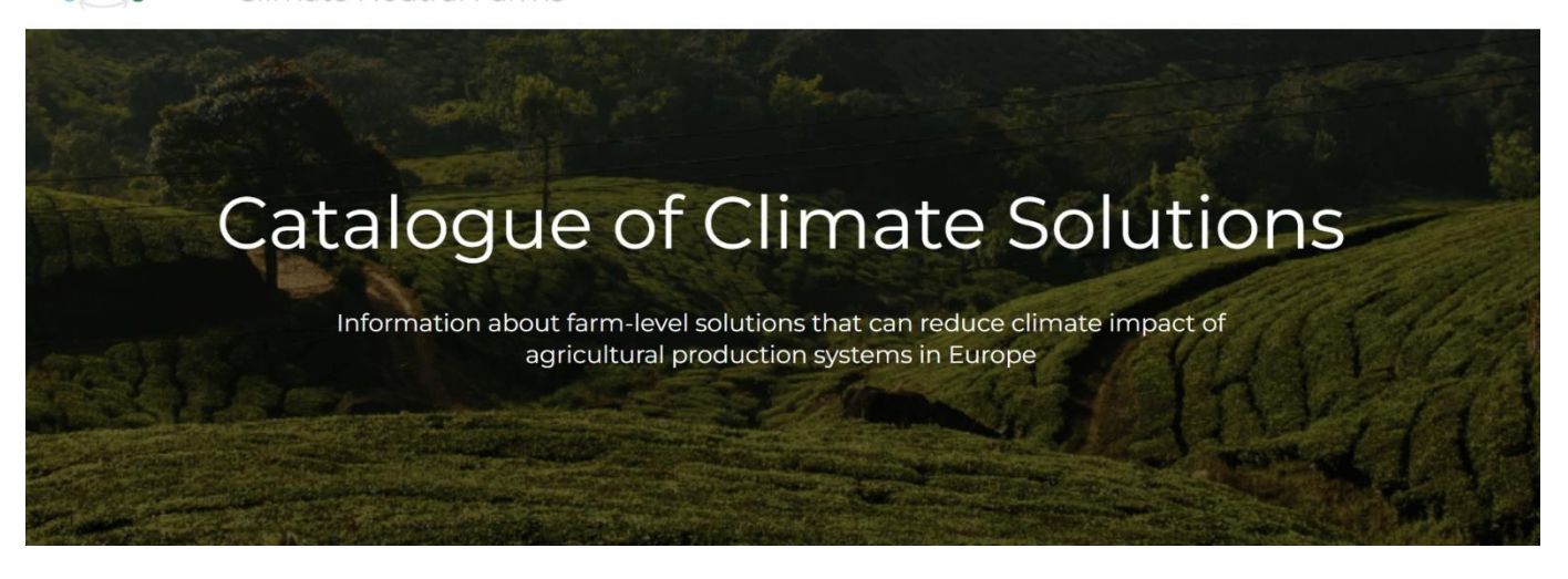
Figure 1: The Catalogue of Climate Solutions available in the ClieNFarms website.